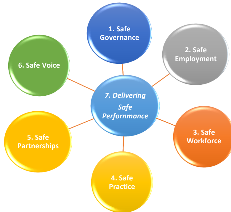
Figure 1 Swansea Model

“Doing nothing is not an option – Spot it, Report it!”